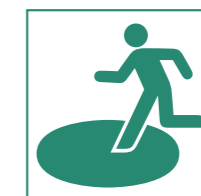
Safety evacuation area 应急避难所