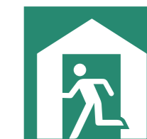
Safety evacuation shelter 固定避难所